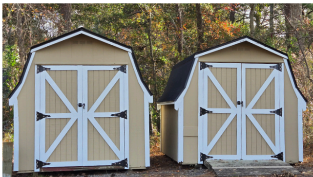
New doors on recently painted ramp-side sheds.