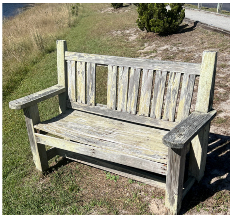
South Bench (Before)

George Beach and Joel Newton rebuilt the two benches along the Hillcrest beach access road: