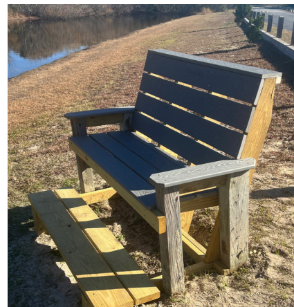
North Bench (After)

The original north bench was in worse shape than the original south bench shown above. They were literally falling apart. All the original material was demolished except for each bench's four legs because they were solid wood and set in concrete. The new benches have Trex seats and backs like the dune crossovers, a level foot rest was added, and overall, their construction is level, plumb and square (except for the legs), which wasn't true of the old benches. In short, they're a big improvement!