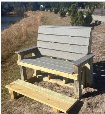
South Bench (After)