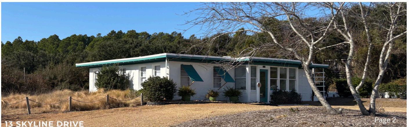
13 SKYLINE DRIVE

As the weather warms up and the days get longer, let's get out and enjoy this great place where we live!