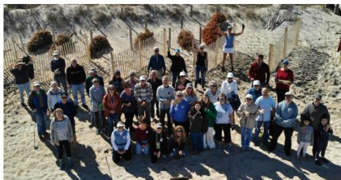
Group Sea Grassers, March 5, 2023

We have had a great turn-out of volunteers - from Corolla, Duck, Kitty Hawk, and Kill Devil Hills, but the majority of volunteers have been from right here in Southern Shores. Most of the days there have been around 15-20 people, but on Sunday March 5th, we had 41 volunteers, resulting in planting 550 ft. in just one hour. I'm hoping for some better weather over the next few weeks, so we can finish up our winter volunteer project this year.