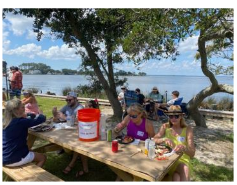
Hard to beat the view while munching on crabs.