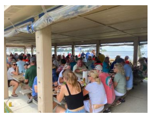
Crab enthusiast under the Marina Pavilion shade.