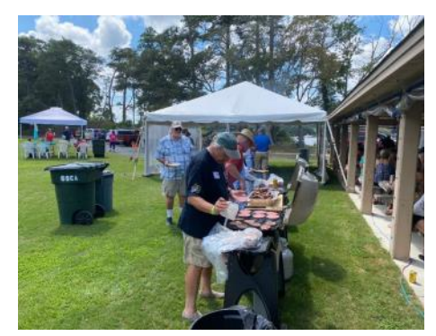
Burgers & Fresh Local Brats were also a hit.