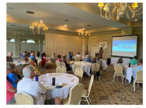
July GAM Meeting

learn from various speakers. We also enjoy socializing and catching up with our neighbors and fellow club members and what is happening in the neighborhood. Some of the previous topics from past members include: Wicked Tuna, OBX Captains, Mid-Currituck Bridge Engineers, The Rum Guys, Dare EMS, Master Gardener, Berlin Air Lift, Identity Theft, Bee Keepers, TOSS Town Manager, Oregon Inlet Update. Nags Head Woods Preserver, OBX Hospital Update, and Lost Colony.