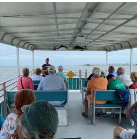
Dolphin Cruise for SSBC Volunteers