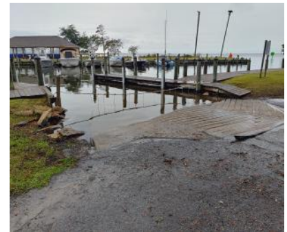
Debris at North Marina