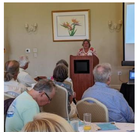
Speaker at GAM Breakfast