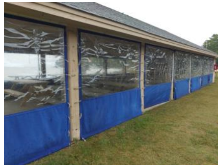
Cleaning the Pavillion